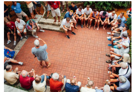
Alumni and undergraduates gather around the Delta Upsilon Memorial Courtyard at 117 Ash

Our Memorial Courtyard includes an engraved brick for DU's donating $500 or more. Families have dedicated bricks for their loved one. Brothers have joined together to fund a brick for their lost brother. We encourage you to support Colonnades and help sustain Delta Upsilon for future generations.