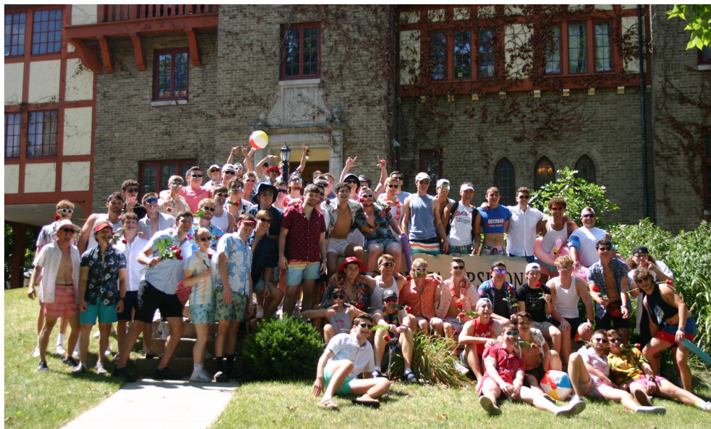
The undergraduate chapter took part in the Sorority Serenades as campus slowly brings back traditions from before the pandemic.

As my time as chapter president comes to an end, I want to thank everyone involved for support and buy in that building a successful chapter has taken. There will always be many men behind the scenes but because all of our brothers, the chapter has been able to thrive in difficult times. I have been proud to be a part of Delta Upsilon at Iowa State so far and I look forward to the future of our great chapter.