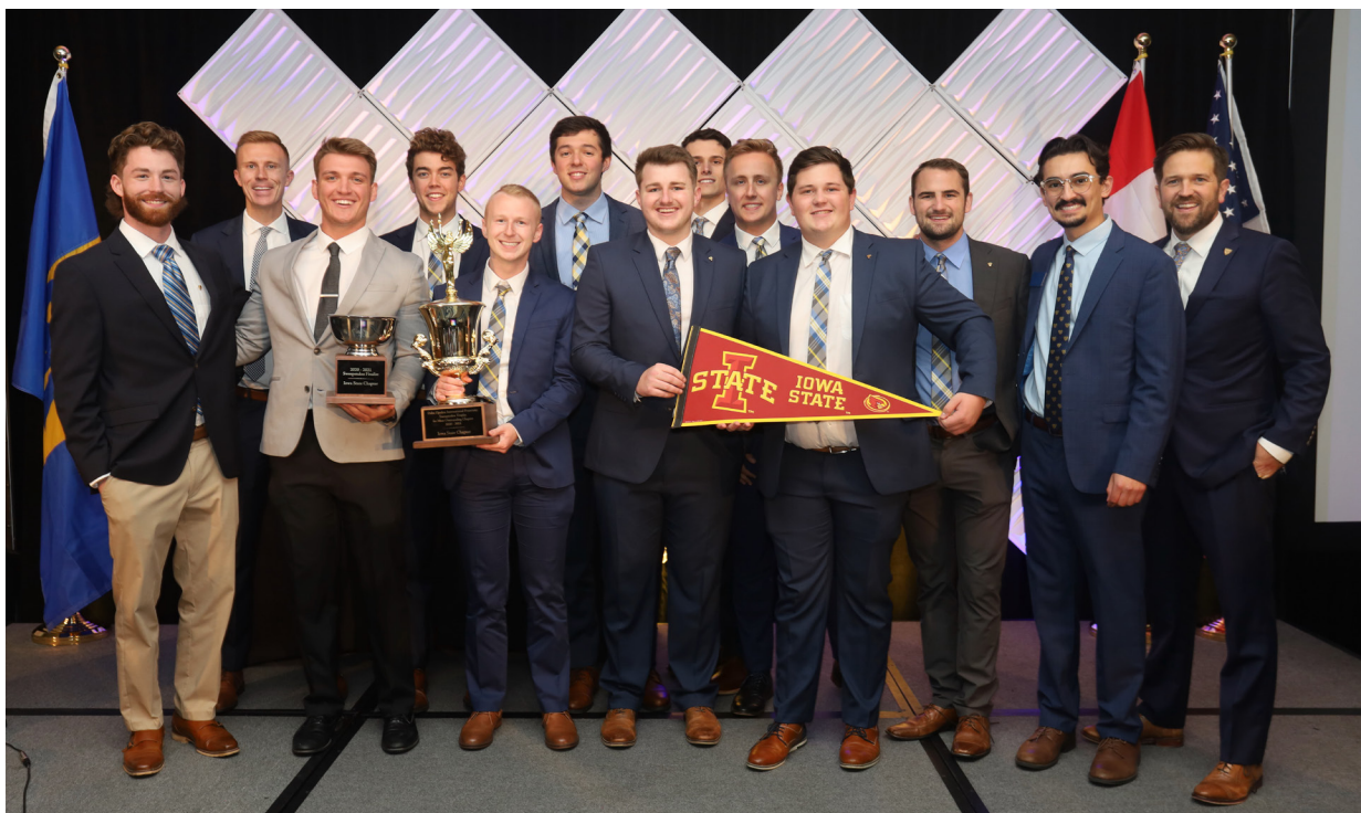
The chapter received the highest award given to undergraduate chapters at this summer's Leadership Institute in New Orleans. This is the first time the chapter has received this award for Sweepstakes.

The annual Sweepstakes finalists are based on the previous academic year's performance. The 2020-2021 school year was very challenging for all fraternities due to COVID-19 and our chapter was no exception. Our undergraduate men did not use COVID-19 as an excuse and continued to improve the chapter in multiple areas. The chapter achieved a 3.31 chapter GPA, volunteered more than 25 hours per member, and raised a significant amount of money for DU's philanthropy, Global Service Initiative. This all led to the most successful year for our chapter since DU returned to Iowa State's campus nearly 10 years ago. Please help us congratulate our undergraduate chapter for an extremely successful school year!