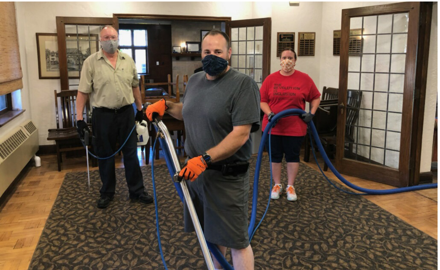
Professional cleaners work on the house carpets this summer. Additional vendors delivered a deep cleaning. During the semester professional cleaners will disinfect high touch areas.